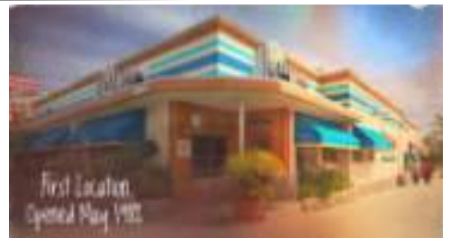
FAREWELL Islands! Hope you'll return!

There are some changes coming in our neighborhood. My favorite West L.A. Islands Restaurant is closing on October 21. I will miss going there for delicious food. Did you know that this Islands Restaurant is the very first one to open of all the Islands Restaurants? It opened in May 1982! That means it has been here for over 36 years! The Westside Pavilion Mall, which opened in 1985, is closing and converting into modern office spaces. I will miss the food court but I am also excited about how nice the new place will look and new restaurants that will open there. Maybe Islands Restaurant will reopen there? That would be awesome because then it will be even closer to us!