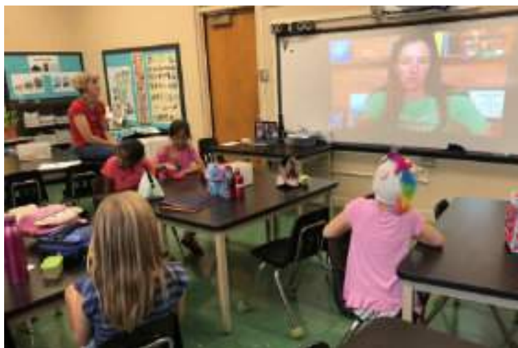
E-MEETING our Water Campaign mentor

Eco-conscious students research and tackle water issues